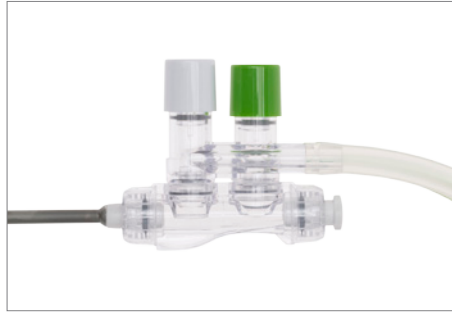
Suction and irrigation - handpiece